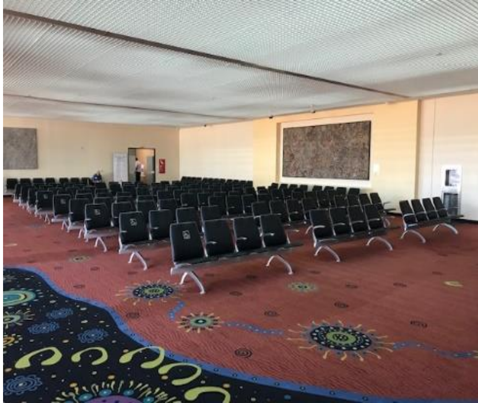
New Terminal Passenger Seating