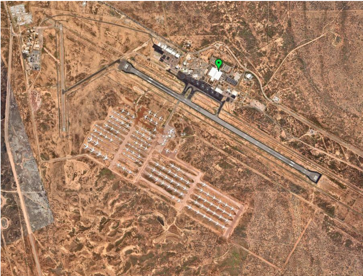
Asia Pacific Aircraft Storage

Over 150 aircraft were placed in storage at the APAS facility. Stage 4 expansion is nearing completion with stage 5 plans underway. Over 110 employees have been engaged to maintain the aircraft which has provided a much needed economic boost to the local economy and community. In addition, tourism opportunities have emerged.