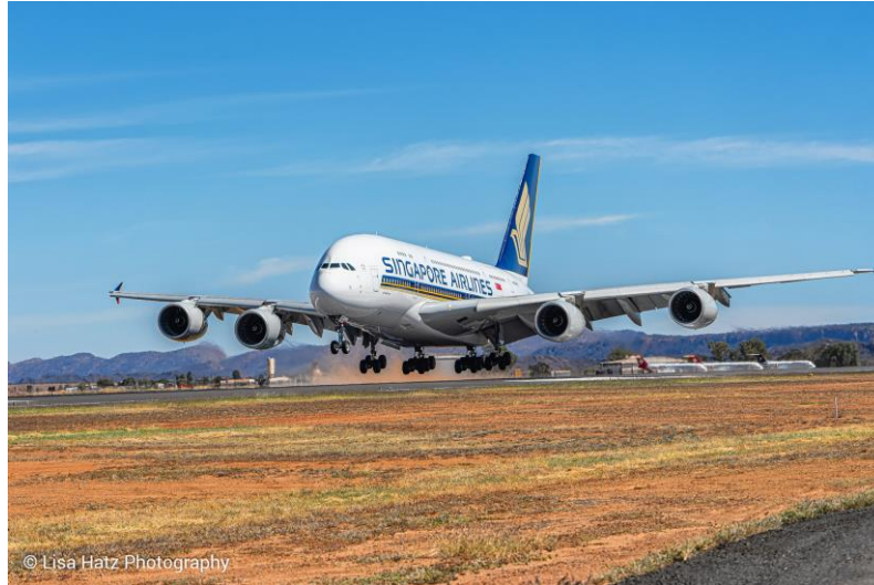
First Airbus A380 to land at Alice Springs Airport to enter storage