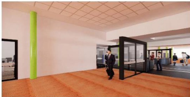
1 PERSPECTIVE 01 (DIAGRAMATIC ONLY)

To introduce and educate the community to the new screening process, a 'Trial Lane' was introduced in November 2020 for passengers to experience and learn about the new technology. The 'Trial Lane' will also provide training for the security screening staff.