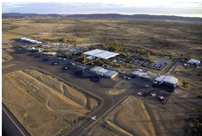
Aerial view of Alice Springs Airport

Alice Springs Airport is the gateway to Central Australia. It is located 14 kilometres south east from the town centre with the airport and town centre separated by the majestic MacDonnell ranges. The airport's neighbours are made up of large cattle stations and vacant Crown land. The township is very well serviced in terms of air connectivity with services to all mainland state capitals.