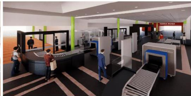
2 PERSPECTIVE 02 (DIAGRAMATIC ONLY)