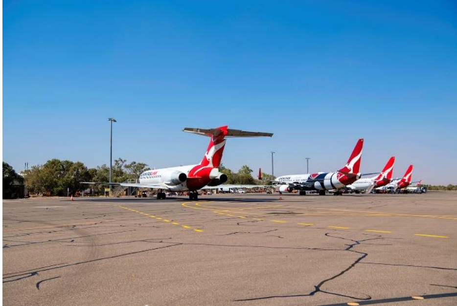
Main Apron Alice Springs Airport

Alice Springs Airport covers a total site of approximately 3,550 hectares, making it the largest Australian Airport in terms of area and in the top ten worldwide. It has considerable opportunities for future growth and expansion.