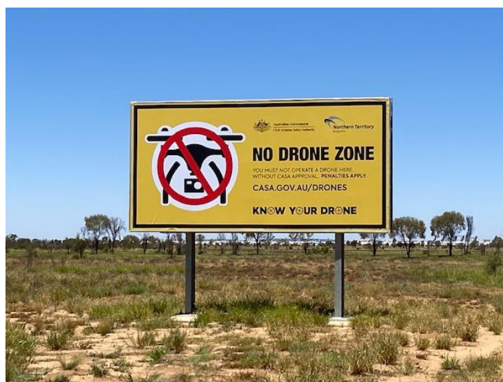
No Drone Zone Program

Due to the interest in the Aircraft storage facility, Alice Springs Airport noted a significant increase in unauthorised drone activity in the area. 5 x CASA 'No Drone Zone' roadside signs have been approved by NT Government to be erected at strategic road locations at approximately 5.5km from the Alice Springs aerodrome boundary. Airservices Australia (AsA) 'drone detection heat map' detected 51 unauthorised drone movements within 5.5km of the airport between Jun and Sep 2020.