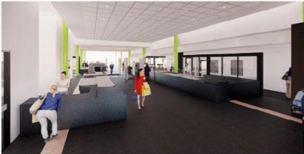
3 PERSPECTIVE 03 (DIAGRAMATIC ONLY)