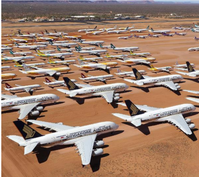
Aerial view of APAS

clients across Asia and Pacific regions. The facility has also injected a much-needed regional economic stimulus with the employment of an additional 110 staff since March 2020. The facility held up to 155 aircraft this FY.