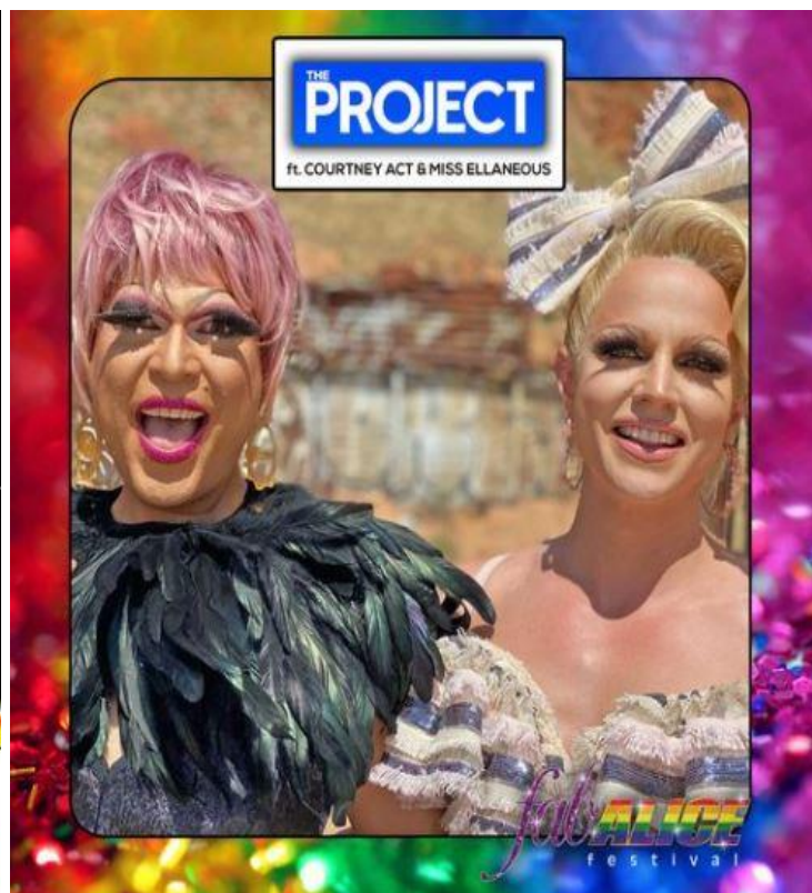
LGBTQI Fabalice Festival