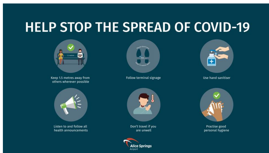
COVID-19 Airport Signage